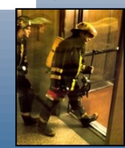
Latest version of Fireman's Service Operation