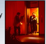
New Battery Back-Up Device