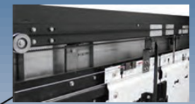
New Closed Loop Door Operator