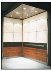
New Cab Interior (Optional)