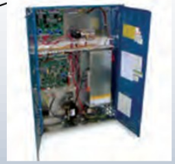
New Microprocessor Controller & Solid State Starter